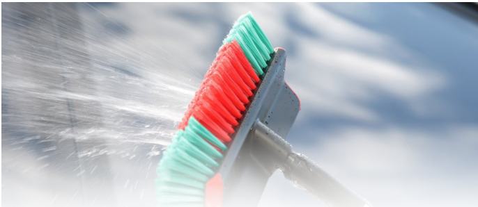
VIKAN TELESCOPIC WATER FED HANDLES